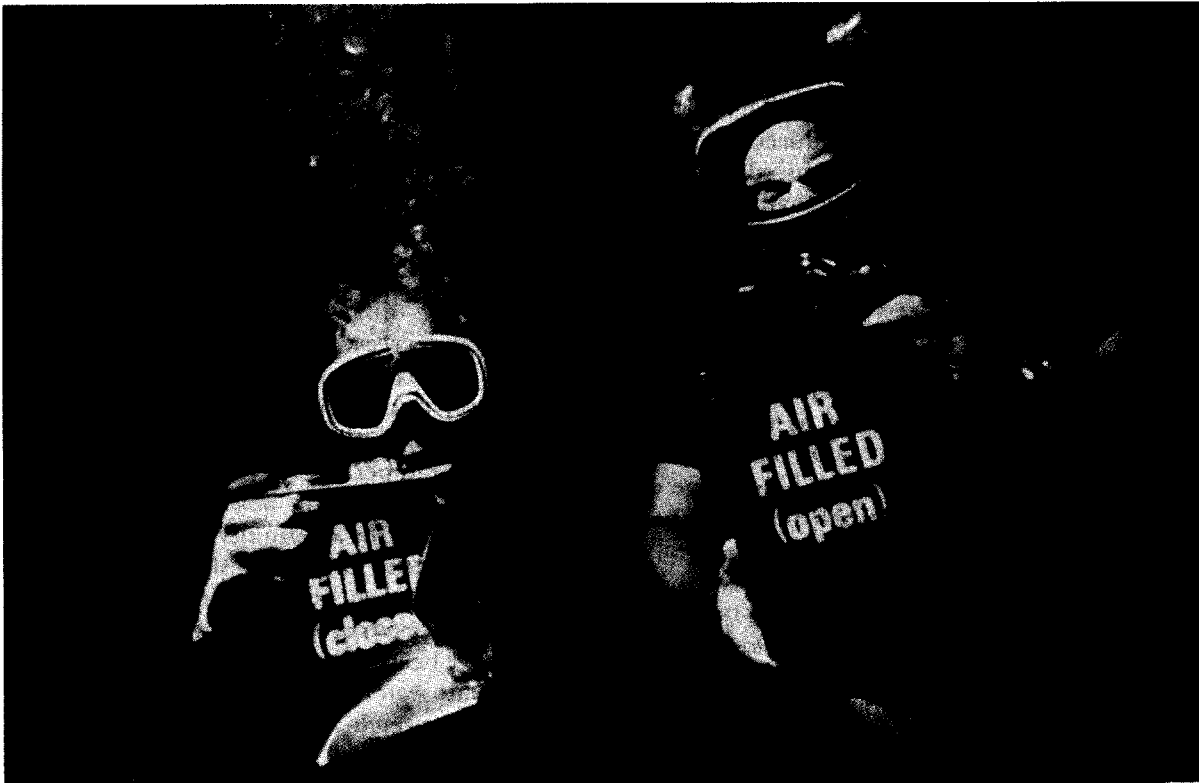
Fig. 2. Boyle's law in action: the mechanism of barotrauma. The can on the right was open on the bottom to allow water to enter and equalize the pressure in the gas space on descent. The can on the left was closed and pressure equalization was achieved by collapse of the can.

out of solution and a gas phase (bubbles) will form in the blood and body tissues. These bubbles may result in the clinical entity known as decompression sickness (DCS). This disorder will be discussed further in Section VI.